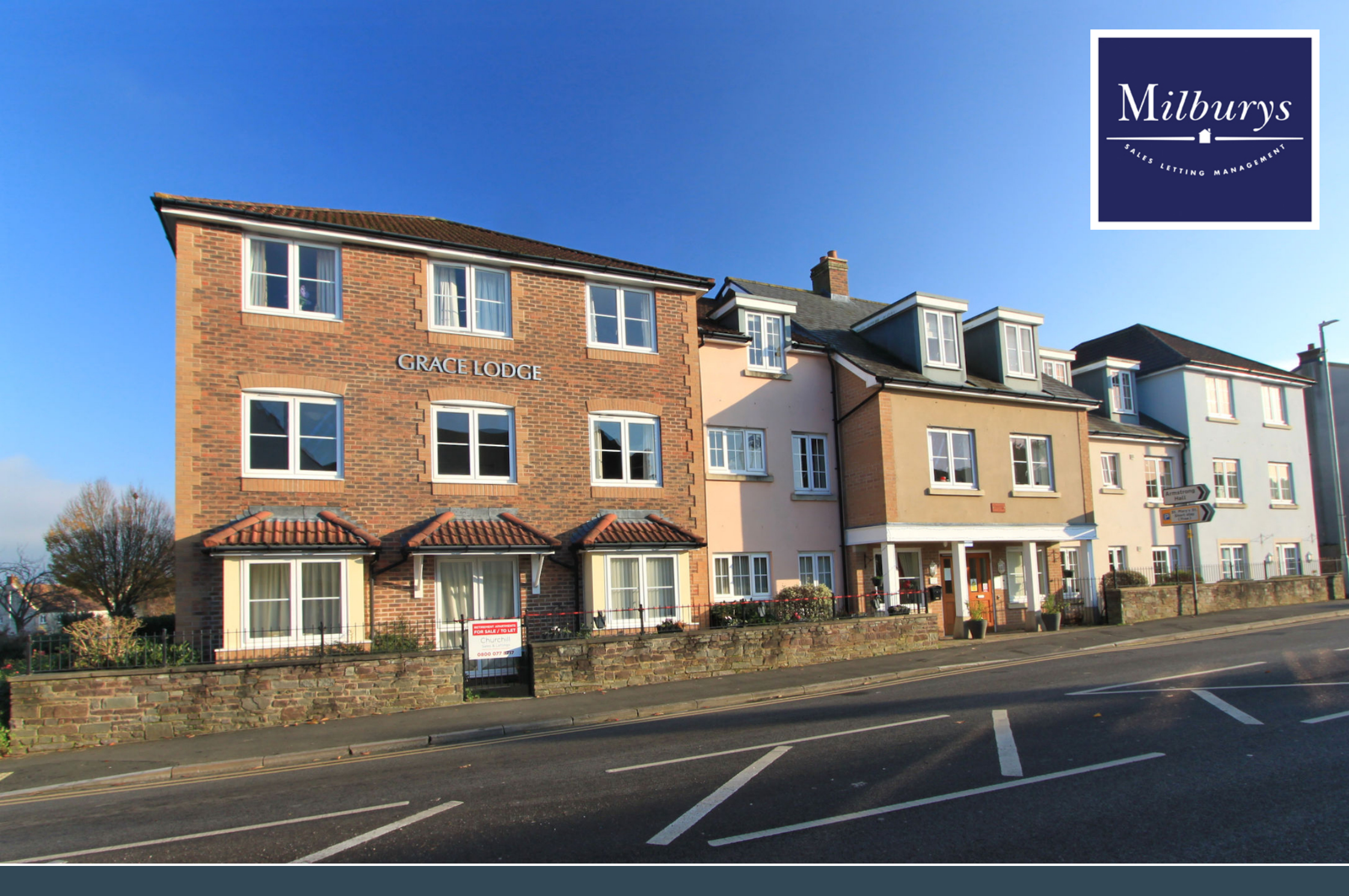
Flat 22 Grace Lodge, Rock Street, Thornbury, South Gloucestershire BS35 2FP