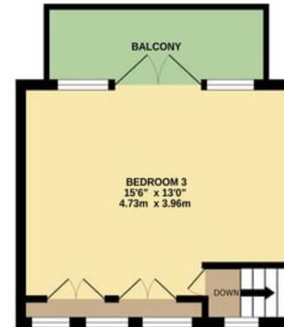
1ST FLOOR 200 sq.ft. (18.6 sq.m.) approx.