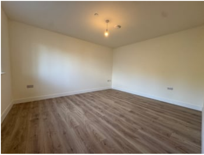
11' 6" x 13' 6" (3.51m x 4.11m) double bedroom with window to front, wood effect flooring, multiple sockets, TV point.