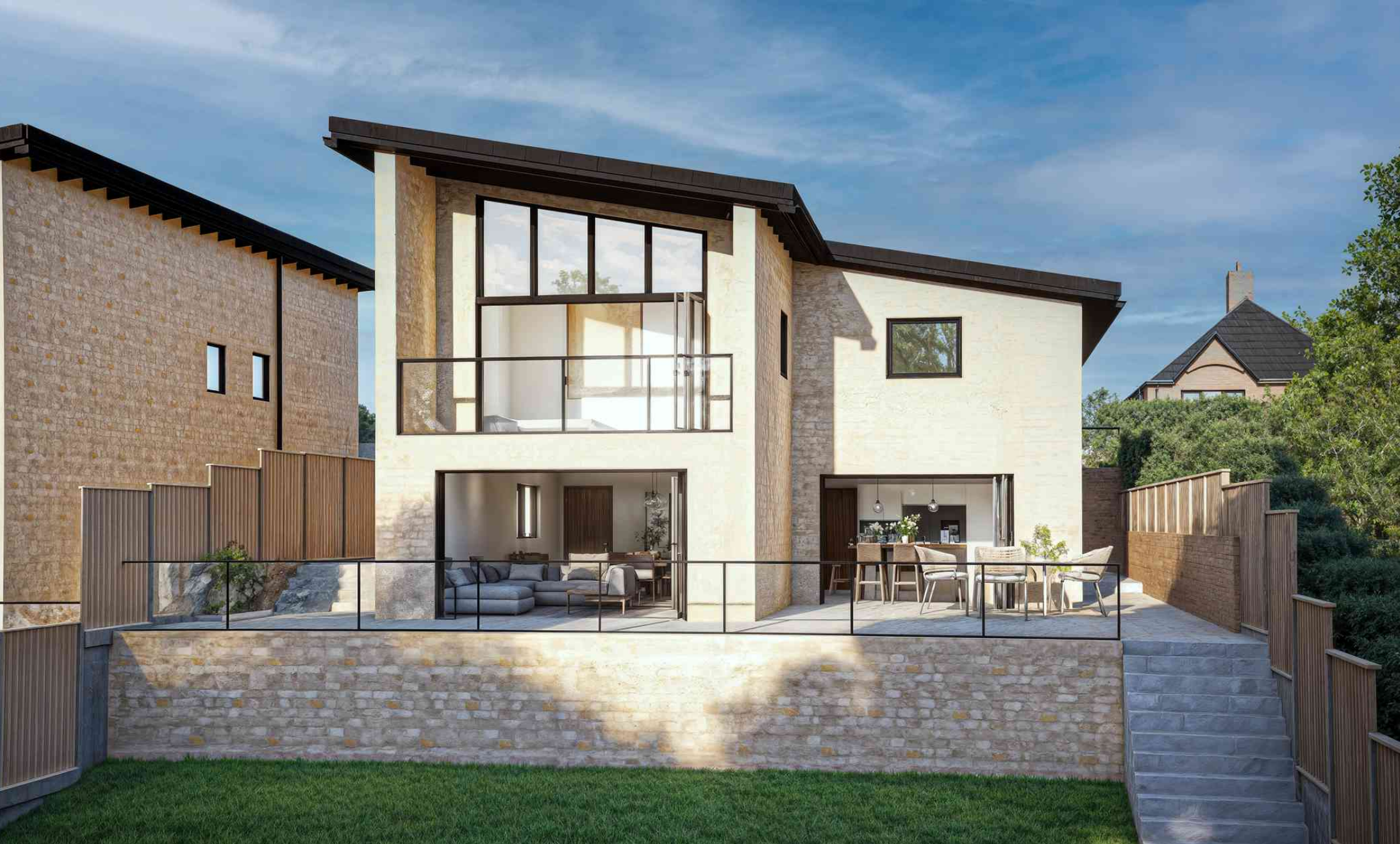
Woolstone House, Dark Lane, Nailsworth, Gloucestershire, , GL6 0DR