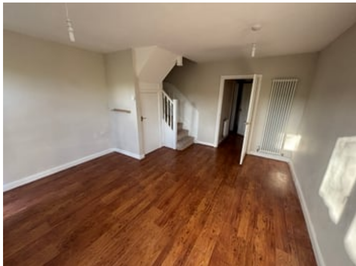
LIVING ROOM (SECOND IMAGE)