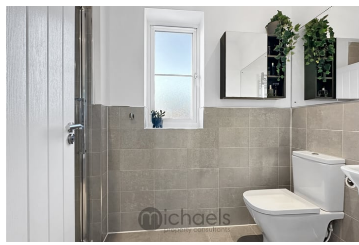
Shower cubicle with tiled wall finish, W.C, wash hand basin, part tiles walls, radiator, wall mounted mirror, inset spotlights, window to rear aspect