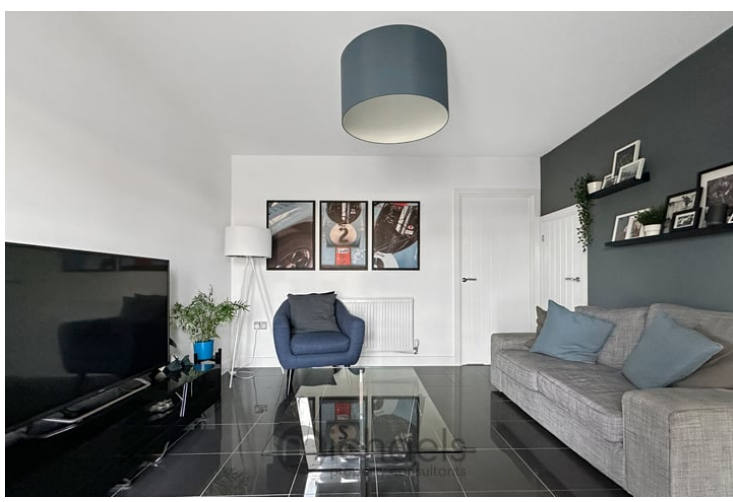
14'6" \times 11'7" (4.42m x 3.53m) Patio doors (providing access to the private terrace at the front) and window to front aspect, radiator, communication points, Tiled flooring, door into: