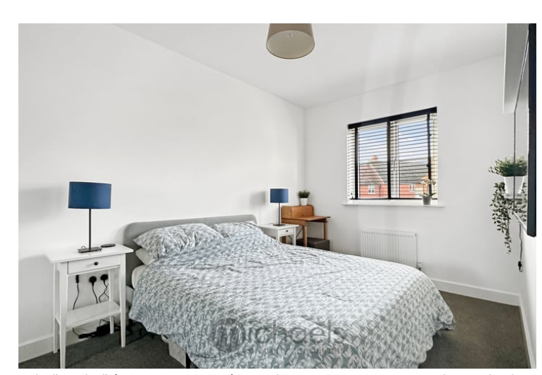
12'9" \times 8'8" (3.89m \times 2.64m) Window to rear aspect, radiator, built in mirror front wardrobes