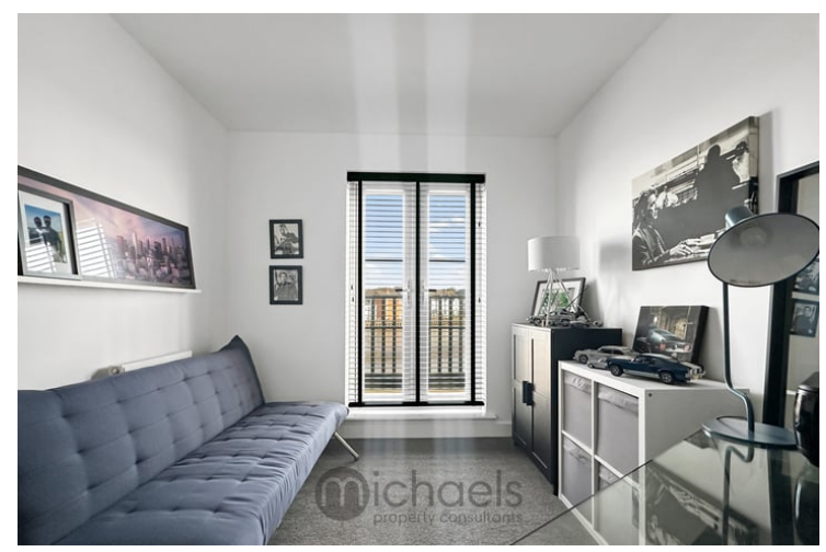
13'\,7''\,x\,8'\,8''\,(4.14\,m\,x\,2.64\,m) Window and patio door to front aspect (leading to private and enclosed balcony overlooking River Colne), radiator