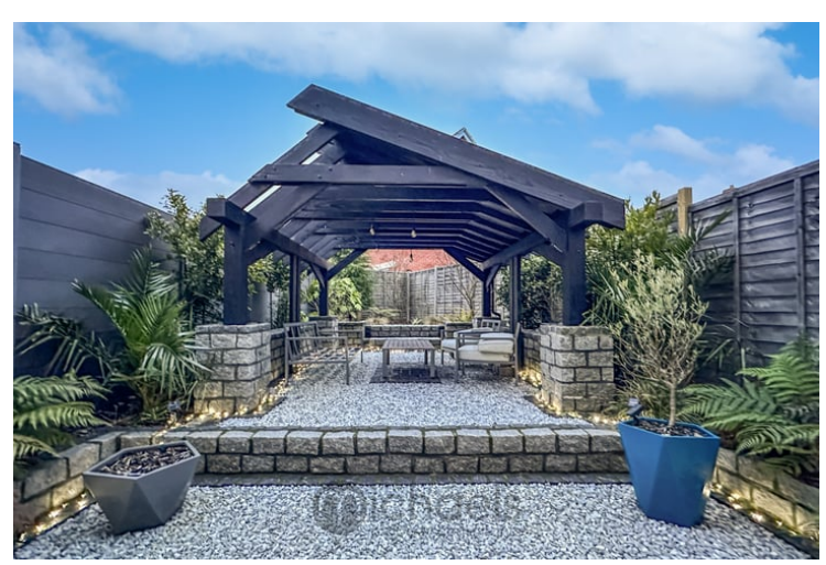
Outside the property offers a meticulously designed garden which has been much improved by the current owner. The garden is enclosed by panel fencing with a raised stone bed, laid to shingle and enclosed by a large pergola, perfect for outside dining or entertaining within the summers months. Access through a side gate, you have the luxury of having the garage attached to the property along with the driveway for multiple vehicles.