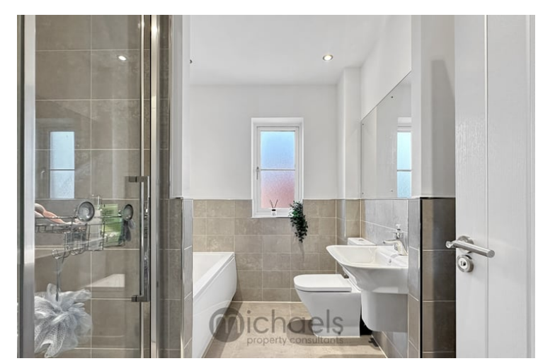
Window to rear aspect, tiled floor, shower cubicle with tiled wall behind, pedestal wash hand basin, W.C, panel bath with screen, shower attachment over and tiled wall finish, inset spotlights, radiator