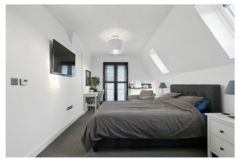
22' 4" \times 10' 1" (6.81 m \times 3.07m) Window and patio doors to front aspect (Juliette balcony, enclosed by a steel railing and glass balustrade), bespoke window shutters, velux style windows to side aspect, radiator, built in 'his & her' wardrobes, door and access to: