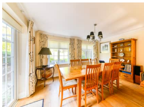
Elmfield Way, South Croydon, Surrey, CR2 0EG