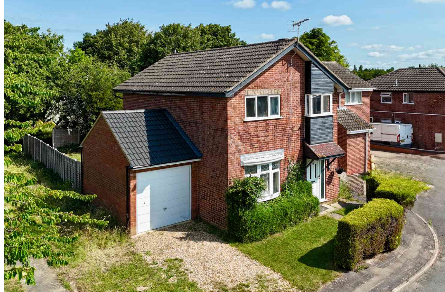
The Wheatsheaves, Sawtry PE28 5NG