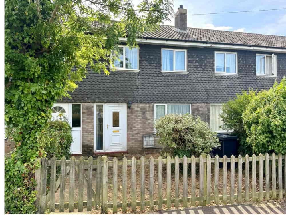
Beech Close, Huntingdon PE29 7BB