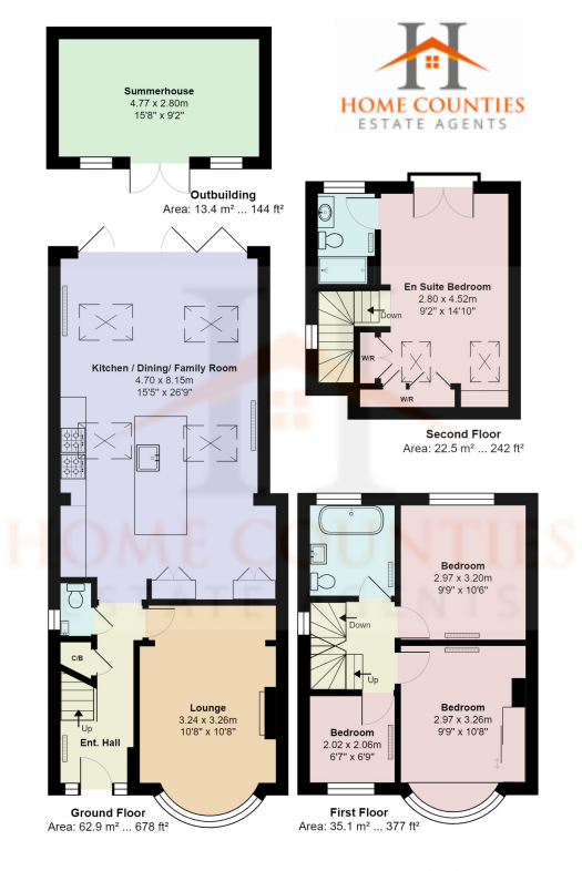
Ormesby Drive, Hertfordshire EN6