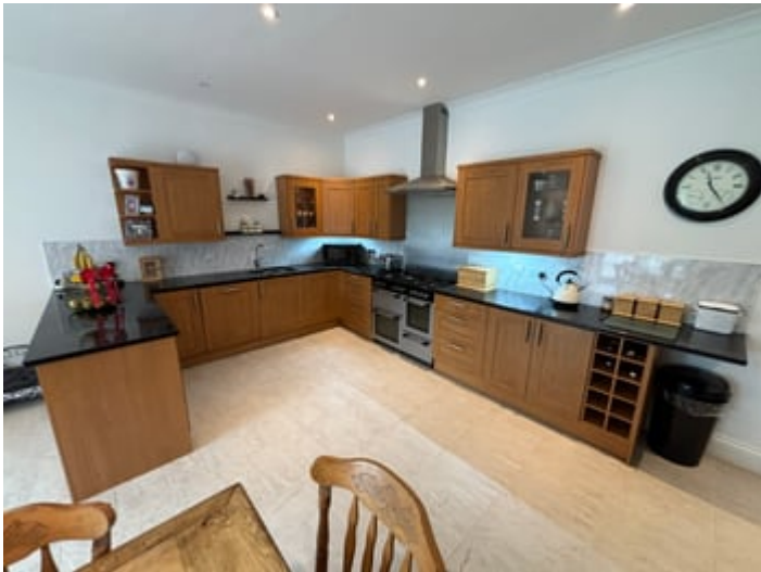
KITCHEN (THIRD IMAGE)