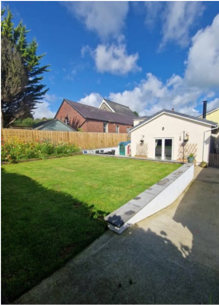
GARDEN (SECOND IMAGE)