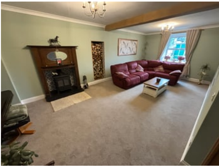
LIVING ROOM (SECOND IMAGE)