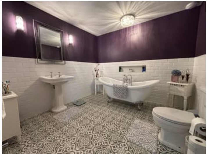
BATHROOM (SECOND IMAGE)

Beautiful Antique style with a roll top free standing bath with shower attachment, low level flush w.c., pedestal wash hand basin, chrome heated towel rail.