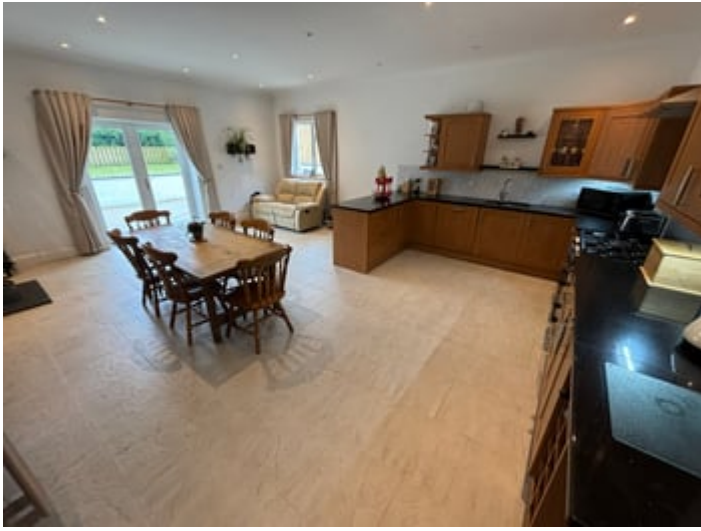
KITCHEN (SECOND IMAGE)

modern fitted kitchen with a range of wall and floor units with granite work surfaces over, 1 1/2 sunken sink and drainer unit, Logik electric/gas cooker stove with extractor hood over, in-built dishwasher, free standing cast iron multi fuel stove on a slate hearth, patio doors opening onto the rear garden area, spot lighting.