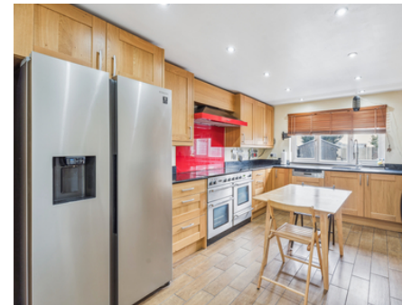
48 East Road, Langford, Bedfordshire, SG18 9QN