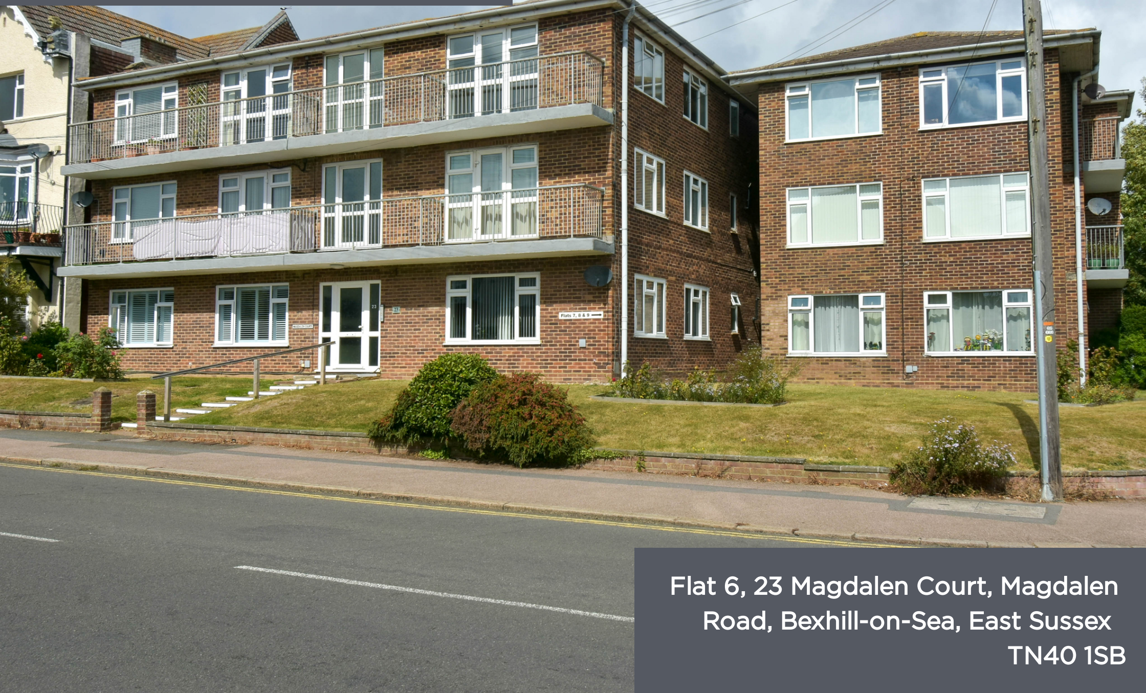
Flat 6, 23 Magdalen Court, Magdalen Road, Bexhill-on-Sea, East Sussex TN40 1SB