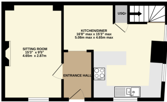
GROUND FLOOR 381 sq.ft. (35.4 sq.m.) approx.