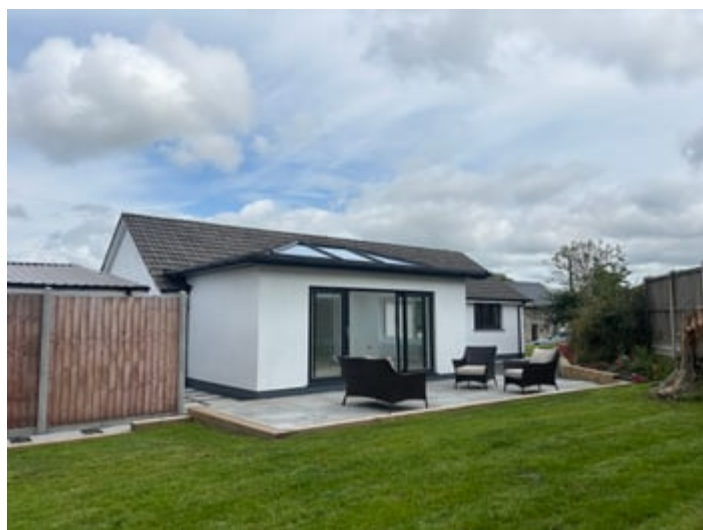
REAR OF PROPERTY (SECOND IMAGE)