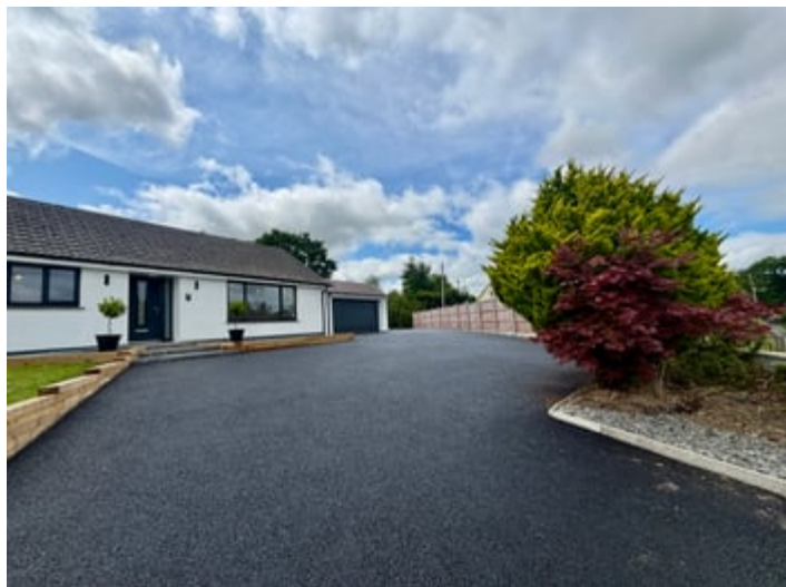
ADDITIONAL PARKING AREA

A newly tarmacadamed driveway with ample parking and turning space with additional parking next to the garage for a motorhome or overflow parking area.