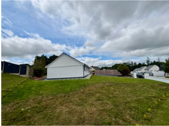
FRONT GARDEN (SECOND IMAGE)