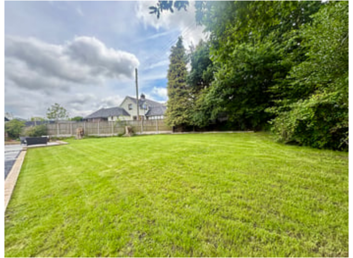
REAR GARDEN (THIRD IMAGE)