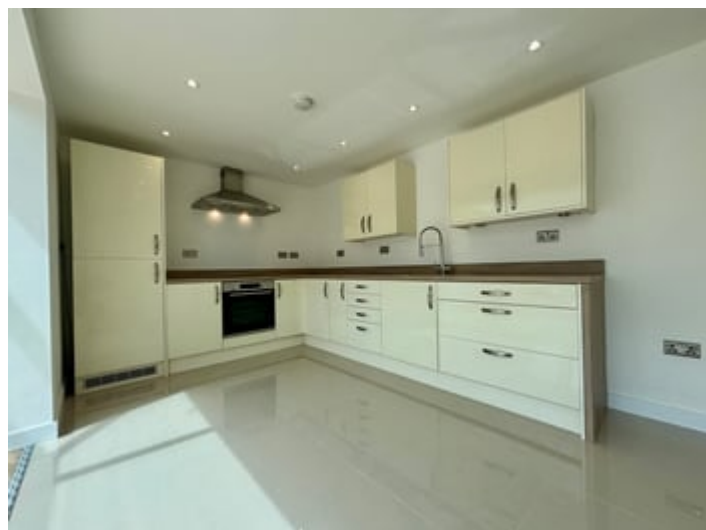
KITCHEN (SECOND IMAGE)