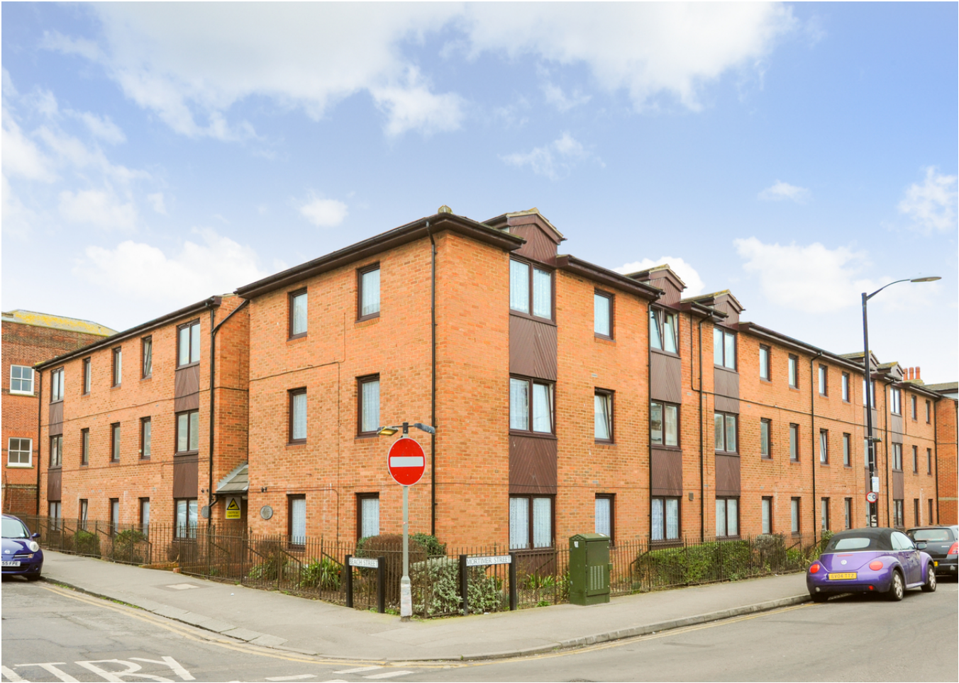
Flat 33 Brian Roberts House, Beach Street, Herne Bay, Kent, CT6 5PW

Total area: approx. 40.6 sq. metres (436.8 sq. feet) Flat 33, Brian Roberts House, Beach Street, Herne Bay