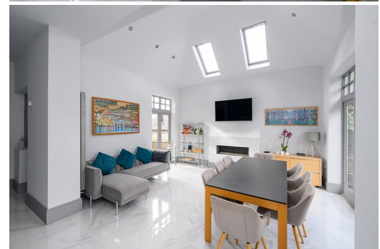
7.65m x 7.41m (25' 1" x 24' 4") This is a stunning open plan space situated at the rear of the property