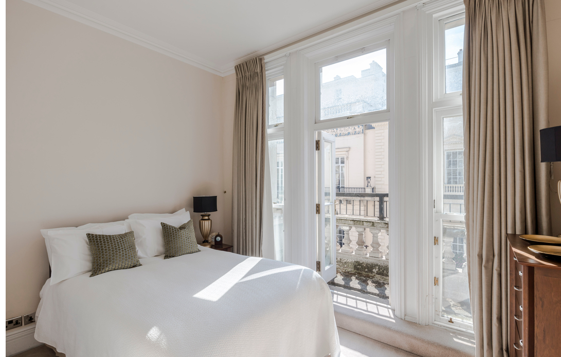
Flat 5 Crusader House, Pall Mall, St James's, London, SW1Y 5LU £1,250,000 - Leasehold