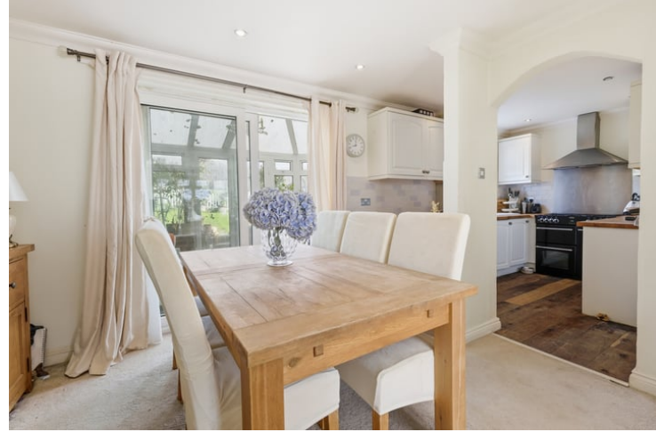
2.62m x 2.56m (8' 7" x 8' 5")