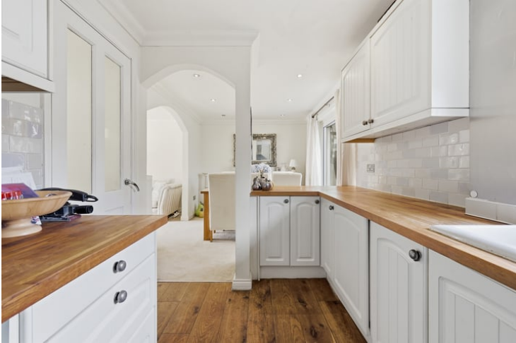
2.62m x 4.17m (8' 7" x 13' 8")