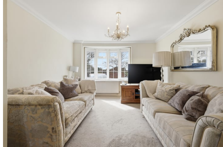
3.97m x 3.53m (13' 0" x 11' 7")