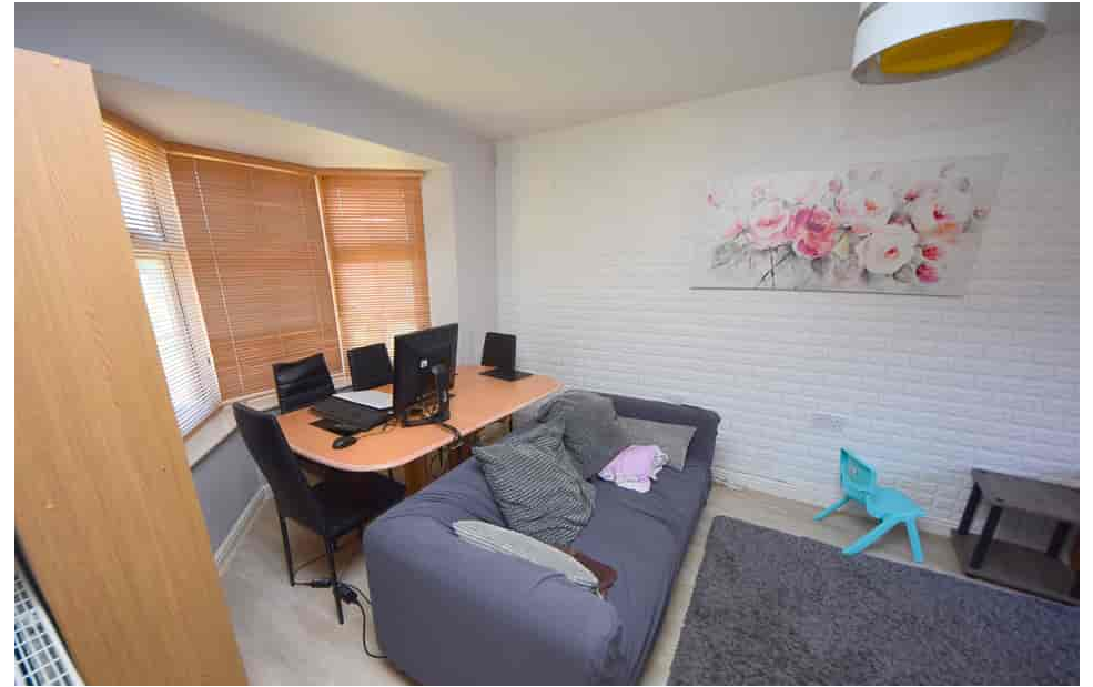
14 Lord Fielding Close, Banbury, Oxfordshire. OX16 1GB Guide Price £295,000 - Freehold