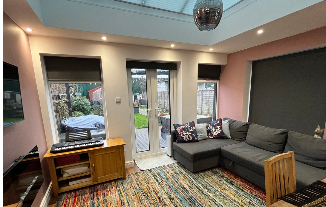
23 Harrow Road, Feltham, Surrey TW14 8RT £484,950 - Freehold