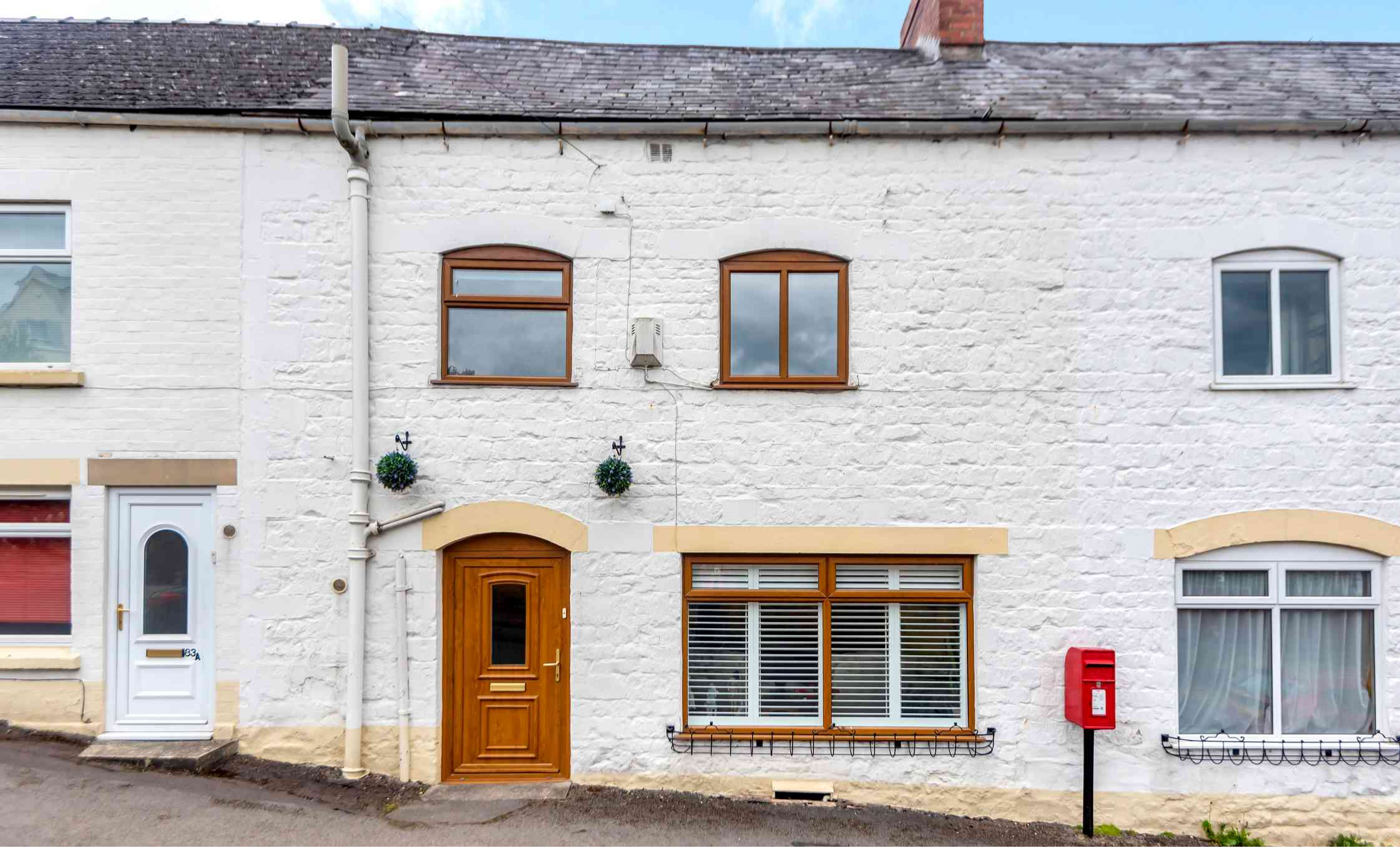
The Old Post Office 85 Bowbridge Lane, Stroud, GL5 2JH Guide Price £470,000