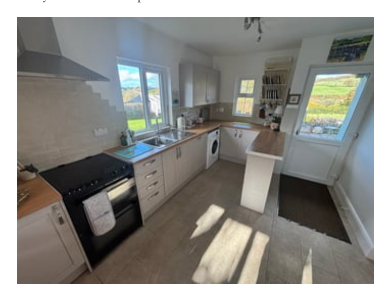
KITCHEN/DINER (SECOND IMAGE)

19' 1" x 9' 5" (5.82m x 2.87m). A Shaker style fitted kitchen with a range of base and floor cupboards with worktop surfaces over, stainless steel single drainer sink unit with swan neck mixer tap with in-built dishwasher and cooker extractor hood, allocated spaces and plumbing for washing machine, electric cooker and fridge/freezer, floor tiled with porcelain tiles throughout, windows to the side, front and rear, UPVC rear entrance door leading to the patio and garden area, radiator, Bespoke Hillary's split window shutters, fitted humidity fan. Dedicated area for Family dining. Access to newly insulated loft space.