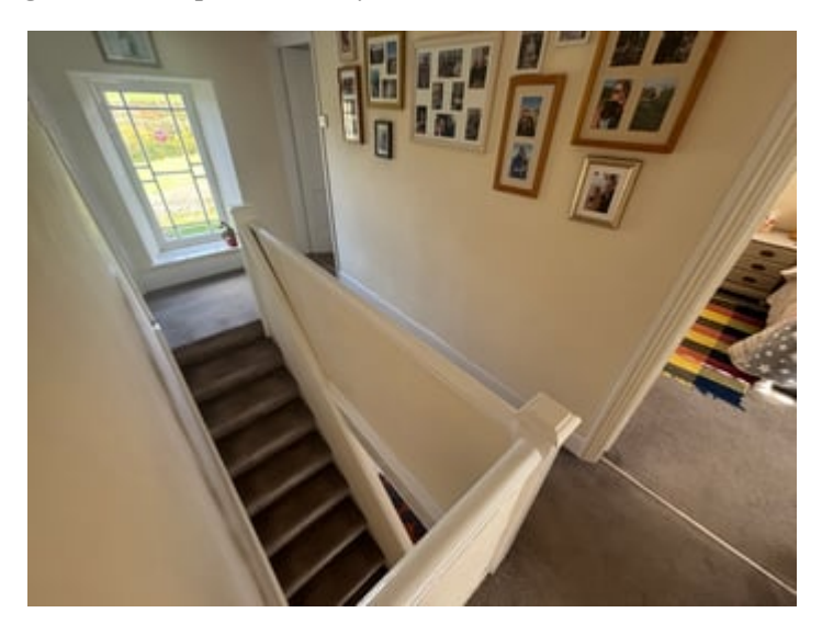
GALLERIED LANDING (SECOND IMAGE)

With staircase leading from the Reception Hall with traditional panelled window to rear enjoying views over the walled garden and open fields beyond