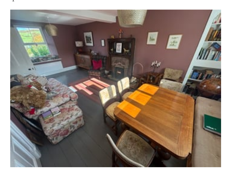
LIVING ROOM (SECOND IMAGE)

21' 11" x 11' 3" (6.68m x 3.43m). With period fireplace housing a new Morso wood burner with attractive designed timber surround, traditional wooden floor, dual aspect UPVC windows to front and rear, two radiators, Bespoke Hillary's split window shutters