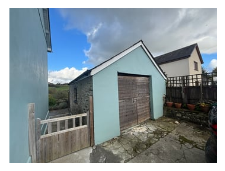
DETACHED GARAGE (SECOND IMAGE)

16' 0" x 12' 9" (4.88m x 3.89m). Of stone and slate construction with electricity and lighting connected.