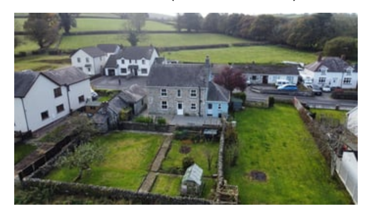
VIEW TO REAR