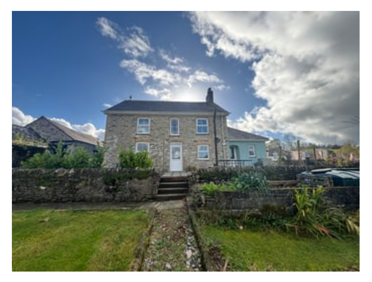
REAR OF PROPERTY (SECOND IMAGE)