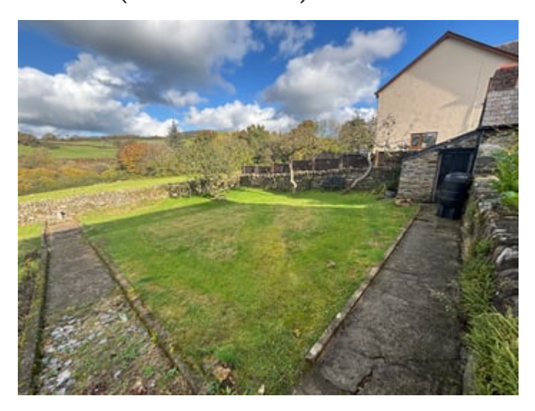
GARDEN (THIRD IMAGE)