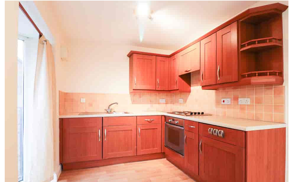
Smiths Court, Northampton NN4 8GH £1,200 pcm