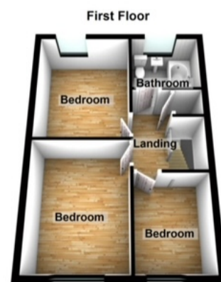
Total area: approx. 91.1 sq. metres (980.9 sq. feet)