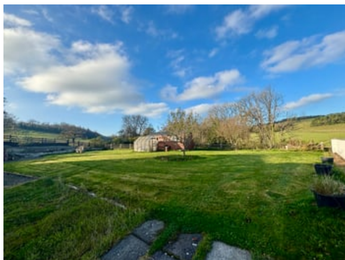
GARDEN (FIFTH IMAGE)