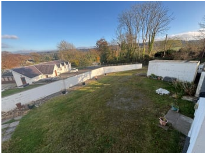
GARDEN (SECOND IMAGE)

The property enjoys extensive and spacious grounds being terraced but with large level lawned areas, being private and not overlooked, and enjoying breath taking views over the surrounding Valley and countryside. It offers ample off road parking to both tiers providing ease of parking if you were to split the property.