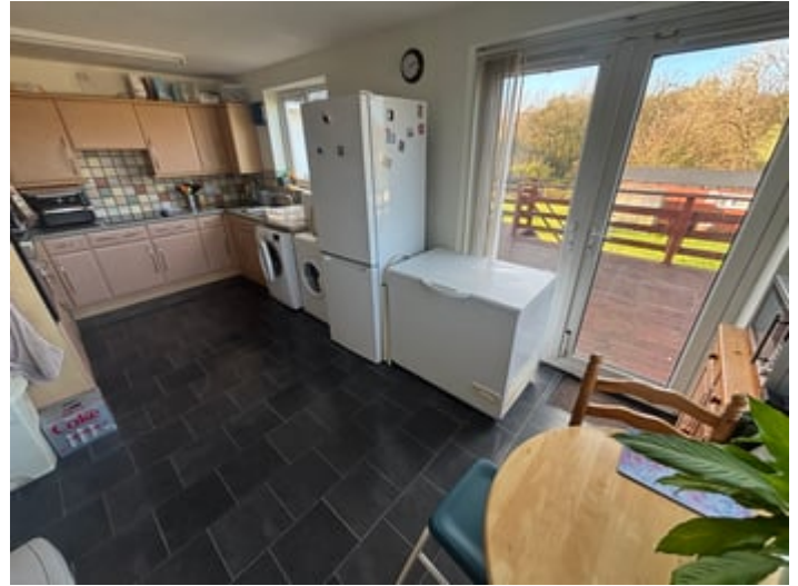
RAISED TERRACED BALCONY