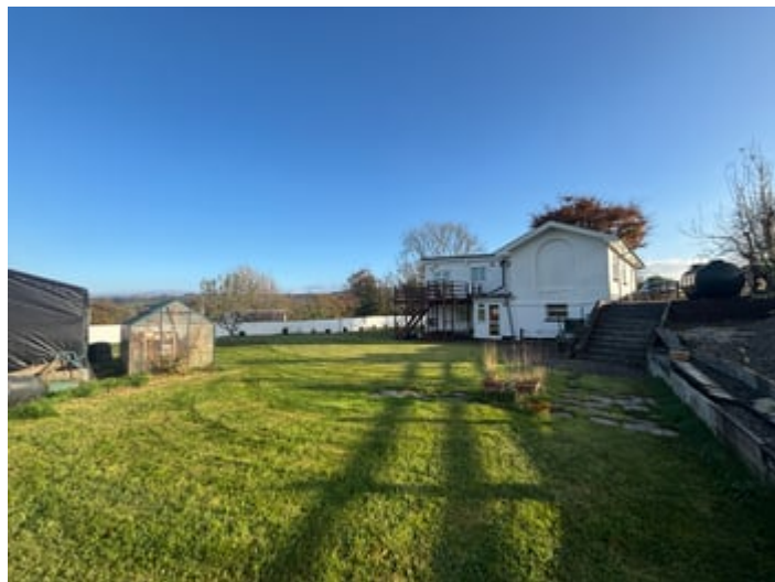
GARDEN (FOURTH IMAGE)