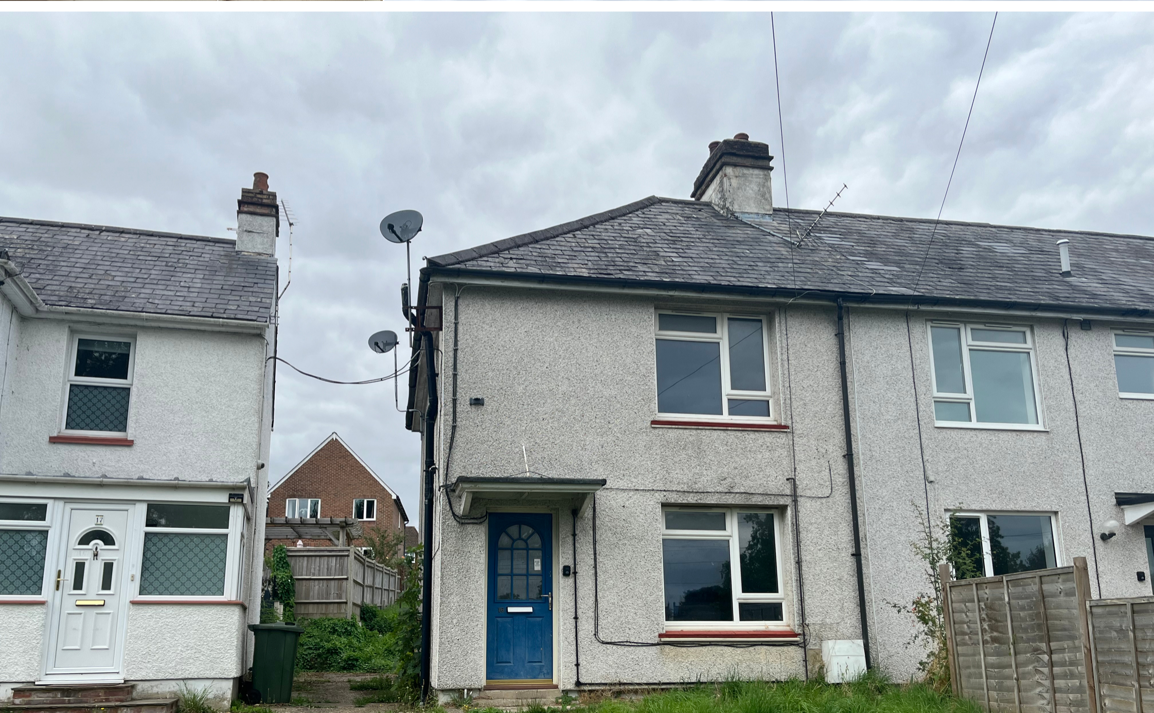
16 Atherton Crescent, Hungerford, Berkshire RG17 0LE Berkshire, £275,000