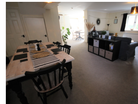
19 Pryors Court, Baldock, Hertfordshire, SG7 6QU