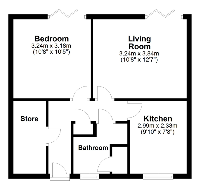
Total area: approx. 45.1 sq. metres (485.0 sq. feet)

All measurements shown are approximate and for guidance only. Garages and workshops are not included in any gross floor areas unless integral to the main building where they will be included. Plan produced using PlanUp.