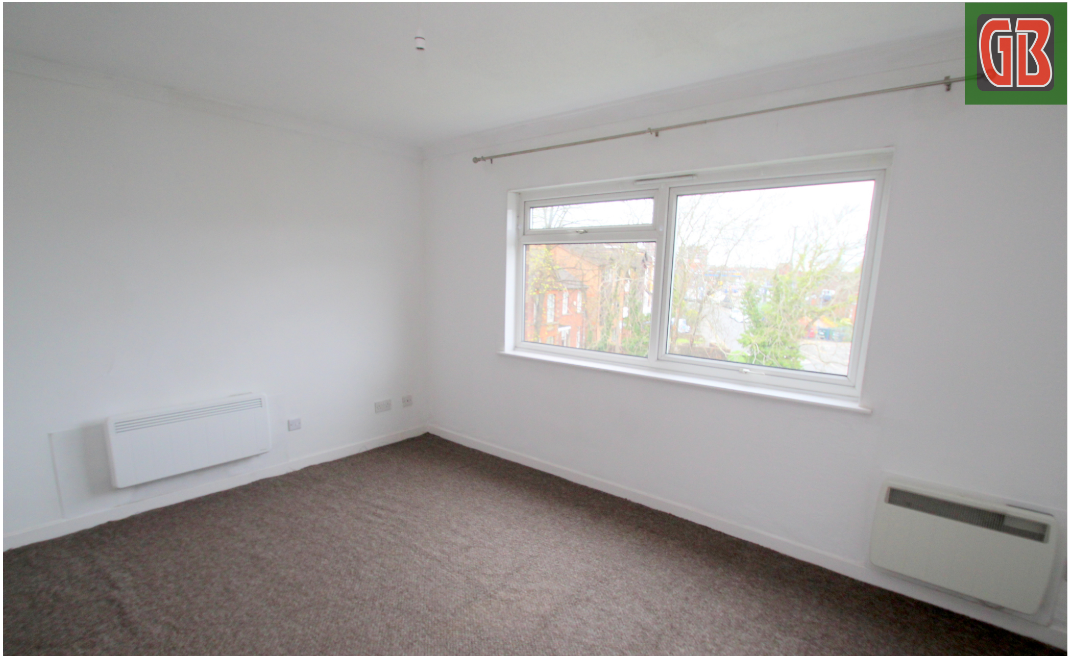
16 Carlton Court, Gresham Road, Staines-upon-Thames, Surrey. TW18 2BL. 1 Bedroom Apartment - £210,000 Share of Freehold