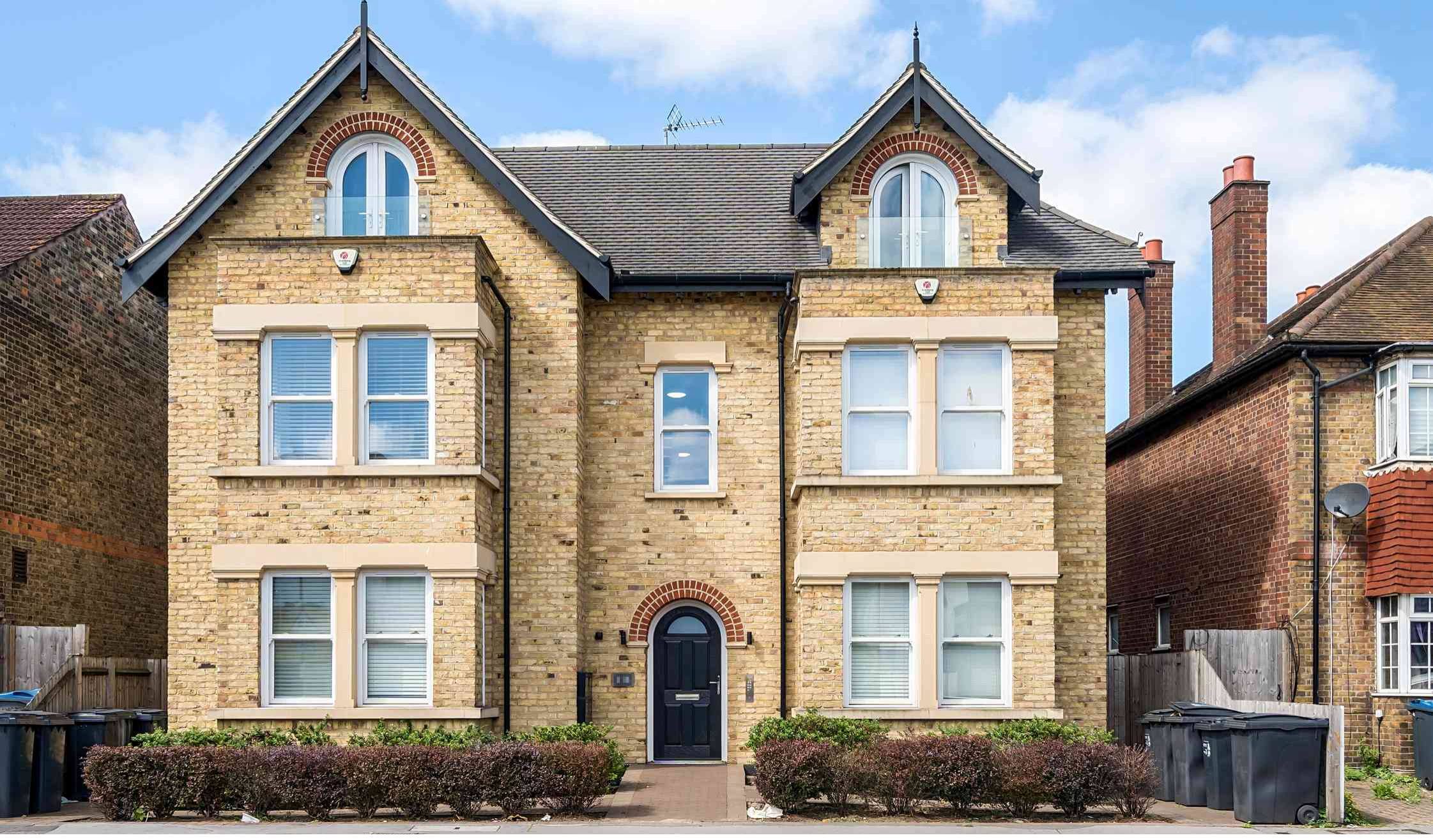
Brighton Road, South Croydon, CR2 6AF