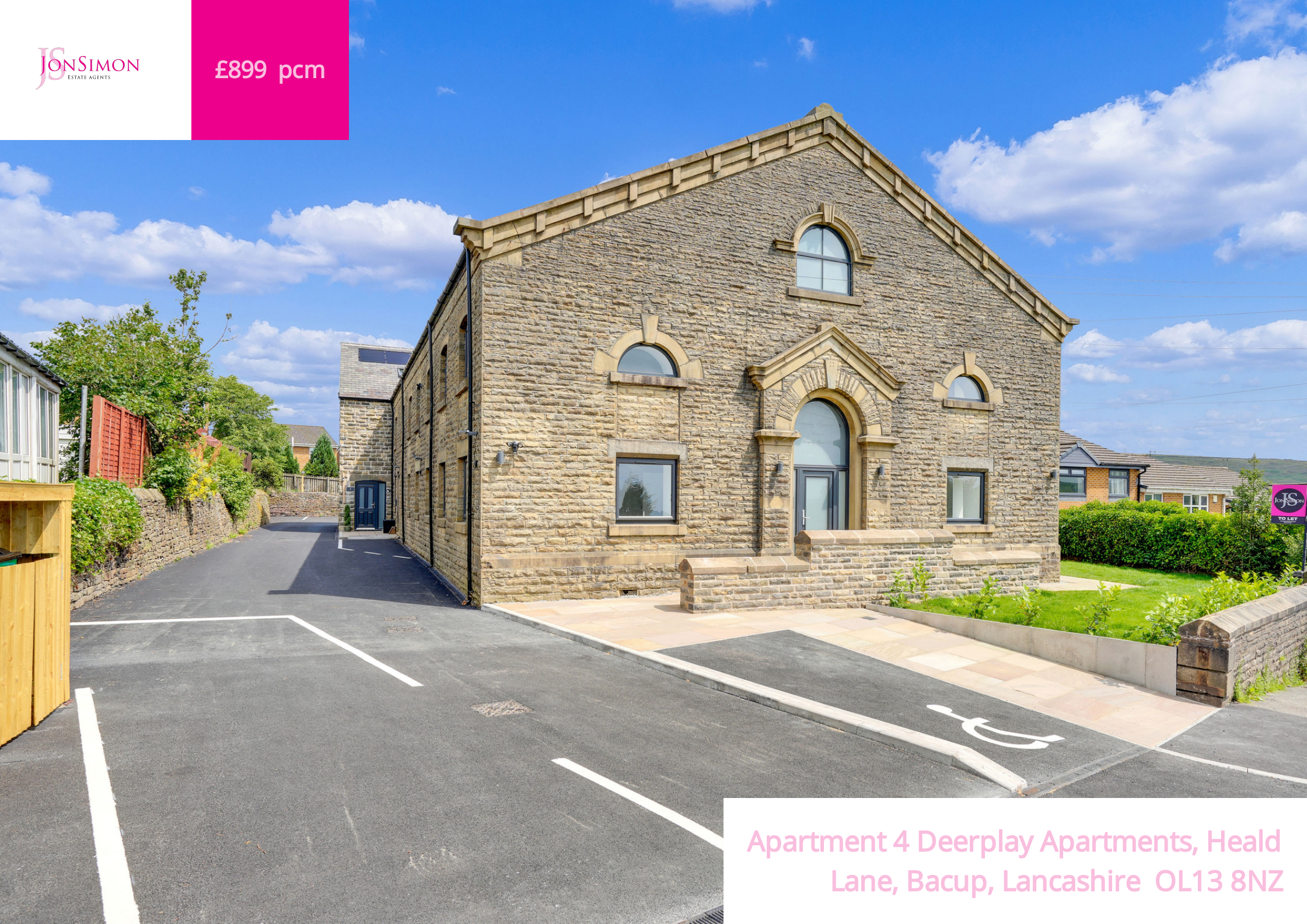
Apartment 4 Deerplay Apartments, Heald Lane, Bacup, Lancashire OL13 8NZ