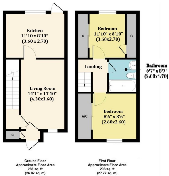
Illustration is for information purposes only, measurements are approximate, not to scale.