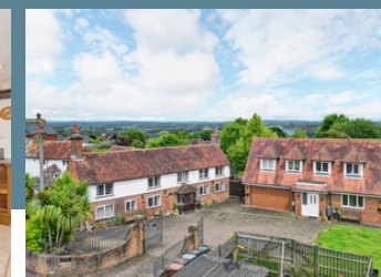
Floral Cottage, Windmill Hill, Herstmonceux, East Sussex BN27