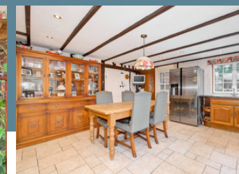
Floral Cottage, Windmill Hill, Herstmonceux, East Sussex BN27