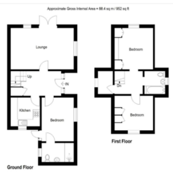
Illustration For Identification Purposes Only, Not To Scale (ID:694126 / Ref.75354)

Wigmore is a popular residential area to the south of Gillingham and east of Hempstead, Initially a small holding area the location has grown and offers a variety of amenities, good connections to the A2/M2, M25 and Bluewater. The local rail station is located at Rainham with good access to London.