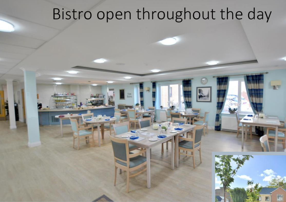
Bistro open throughout the day