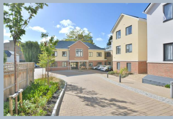
View from sun terrace