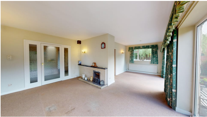
Bedroom With En Suite