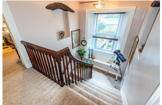
STAIRCASE & LANDING

MASTER BEDROOM (15'8 x 14') Radiator and two secondary glazed sash windows to the front with views across the countryside.