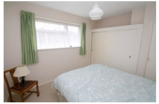
Rear aspect double glazed window, light and power points, radiator, built-in wardrobes.