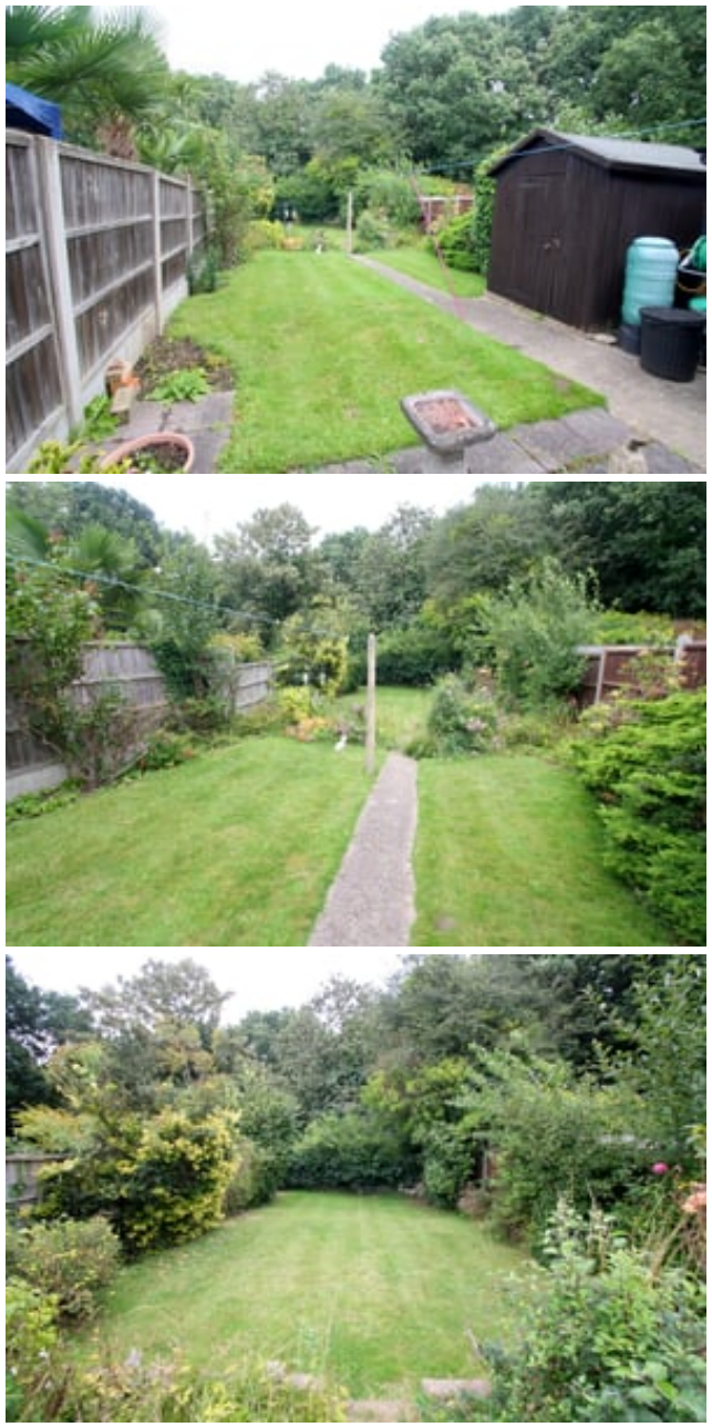
Patio area nearest to property, mainly laid to lawn with shrub borders, enclosed by wood-panel fencing, brickbuilt storage sheds, gated side access to front.