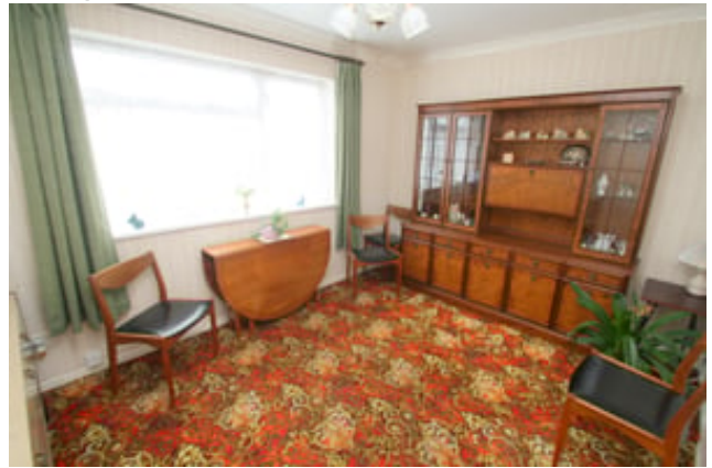
Front aspect double glazed window, light and power points, radiator.