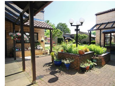
2 The Rickyard, Norton Road, Letchworth Garden City, Hertfordshire, SG6 1AW