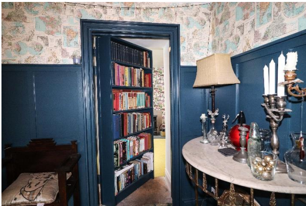
BOOKCASE DOOR TO RECEPTION ROOM 2

RECEPTION ROOM 2 (25'4 max x 9'6 max) Multi fuel stove, original stone feature wall, part glazed ceiling, double glazed window, spiral staircase to bedroom 3 & door to wet room.