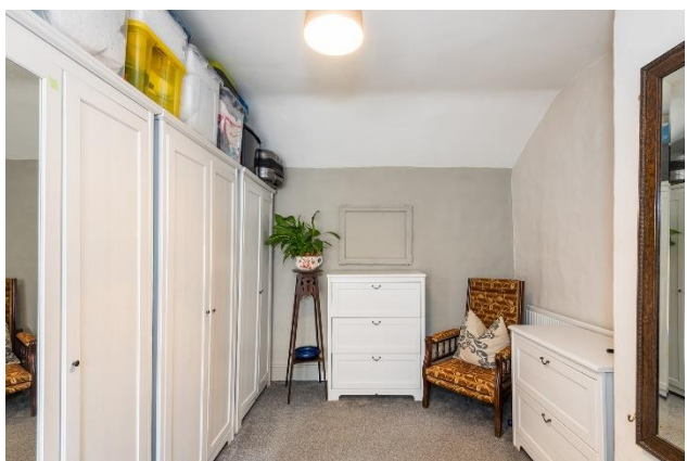
DRESSING ROOM/BEDROOM 4