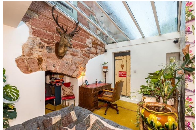
RECEPTION ROOM 2

WET ROOM Fully tiled with double glazed Velux window, two original ceiling beams, overhead shower, WC, wash hand basin and electric underfloor heating.