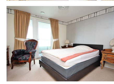
Flat 61 Horizons, 87 Churchfield Road, Poole Park, Poole, Dorset BH15 2FR