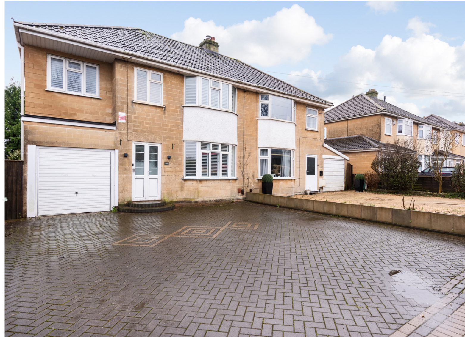
Frome Road, Bath