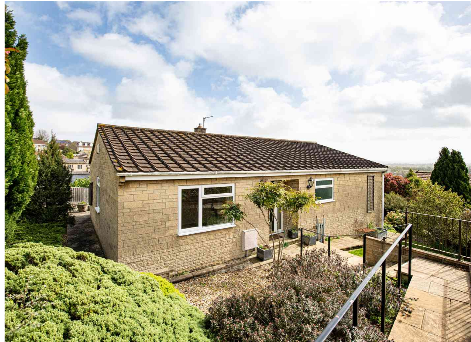
Hare Knapp, Bradford on Avon