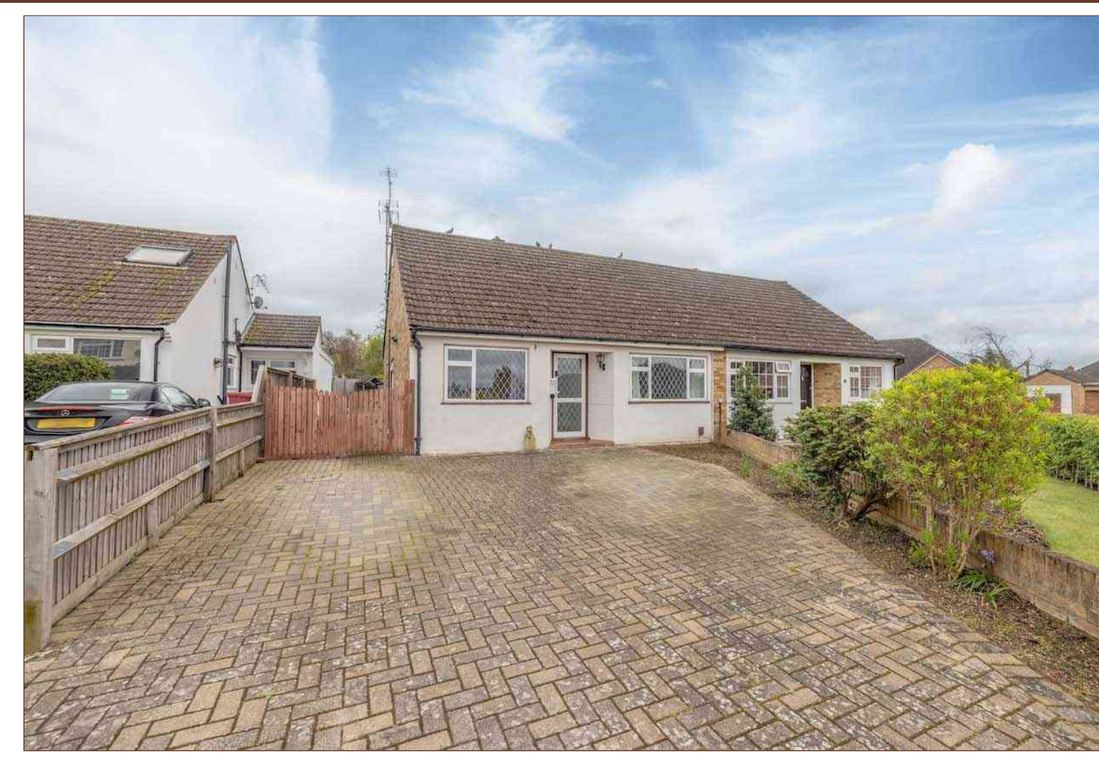
This two bedroom semi-detached bungalow is nicely positioned on a quiet cul-de-sac location and just a short commute from Burnham Rail Station (Queen Elizabeth Line). The property is set on a spacious plot and offers the potential to extend onto the side and/or into the loft (STP).

The layout features a 14ft living room with rear access onto the garden, an11ft fitted kitchen, a shower room, two well-sized bedrooms and an entrance hall.