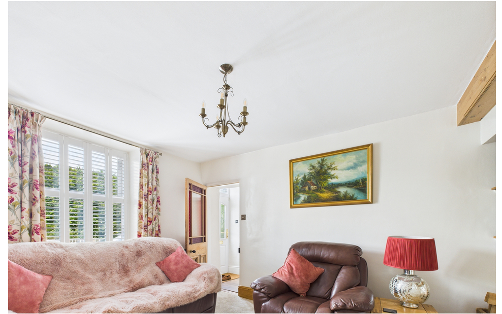
New Road, Heage, Belper, Derbyshire DE56 2BA £330,000 - Freehold