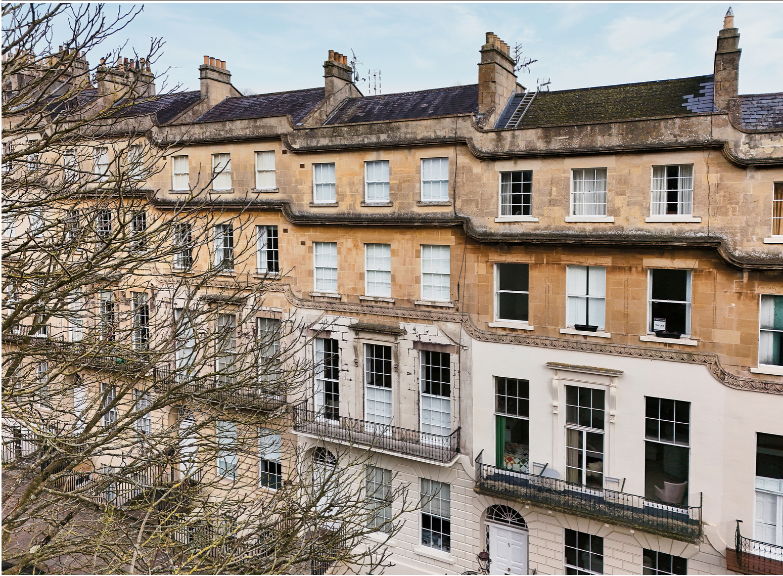
Cavendish Place, Bath