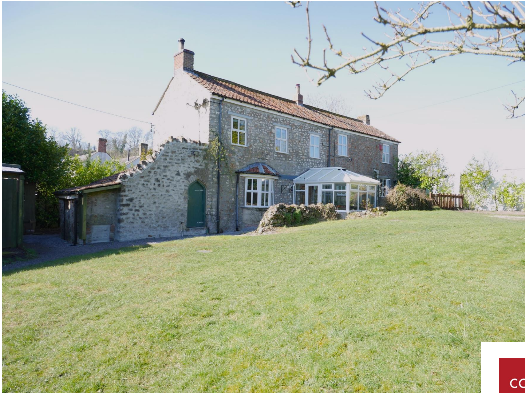
Ivy House, Nettlebridge, Oakhill, Radstock BA3 5AB