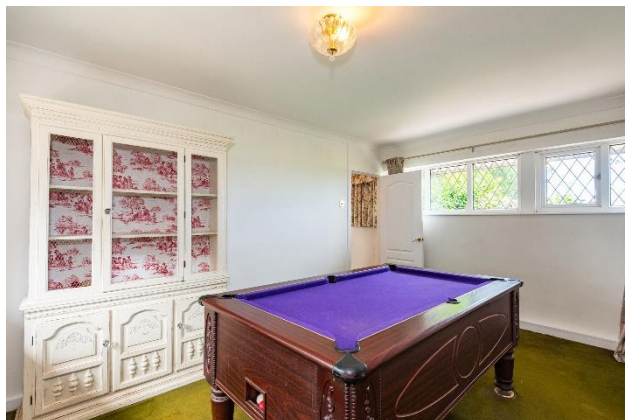
DINING / GAMES ROOM

BATHROOM (8'7 x 7'9) Double glazed window to the rear, heated towel rail, tiled walls, electric shower in walk-in unit, corner jacuzzi bath, wash hand basin, WC and tiled floor with underfloor heating.