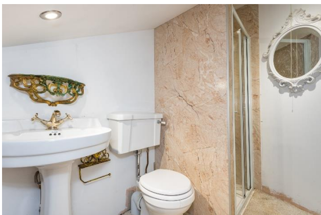
EN-SUITE TO BEDROOM 4

EN-SUITE (9'10 x 5') Heated towel rail, wash hand basin, WC and electric shower in walk-in unit. Built in wardrobe (5' x 4'7) with light and hanging rail.