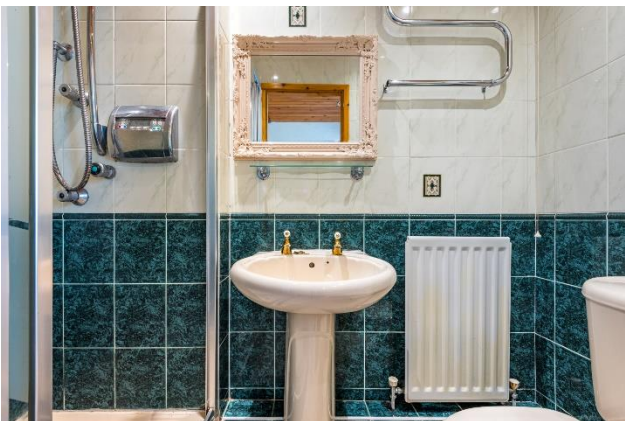
EN-SUITE TO BEDROOM 3

EN-SUITE SHOWER ROOM (7' x 3'4) Walk-in electric shower, wash hand basin, WC, heated towel rail, tiled walls, radiator and wood panelled ceiling.