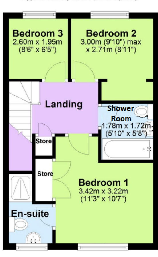
Total area: approx. 64.2 sq. metres (691.0 sq. feet)

Approx. 36.8 sq. metres (396.0 sq. feet)